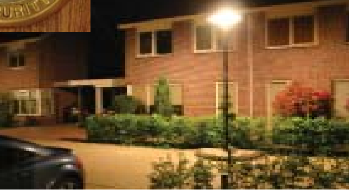
If you have an alarm system use it when you are at home.

Install deadbolts on exterior doors: locks should easily open from inside for emergencies.