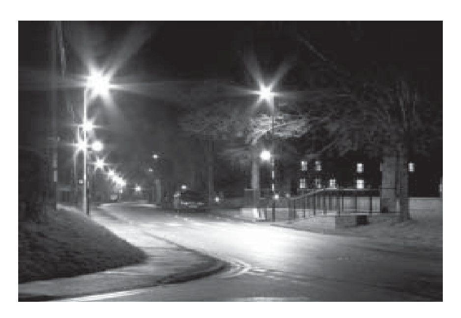
Avoid places or situations that put you at risk.